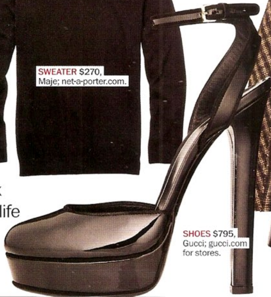
SHOES $795, Gucci; gucci.com for stores.