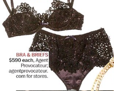
BRA & BRIEFS $590 each, Agent Provocateur; agentprovocateur.com for stores.