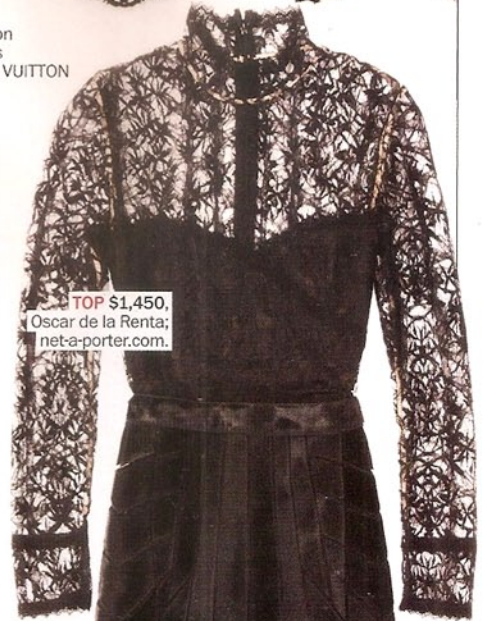
TOP $1,450, Oscar de la Renta; net-a-porter.com.