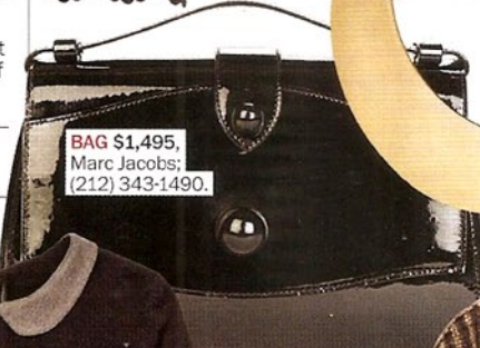
BAG $1,495, Marc Jacobs; (212) 343-1490.