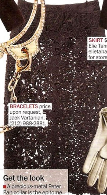
SKIRT $398, Elie Tahari; elietahari.com for stores.