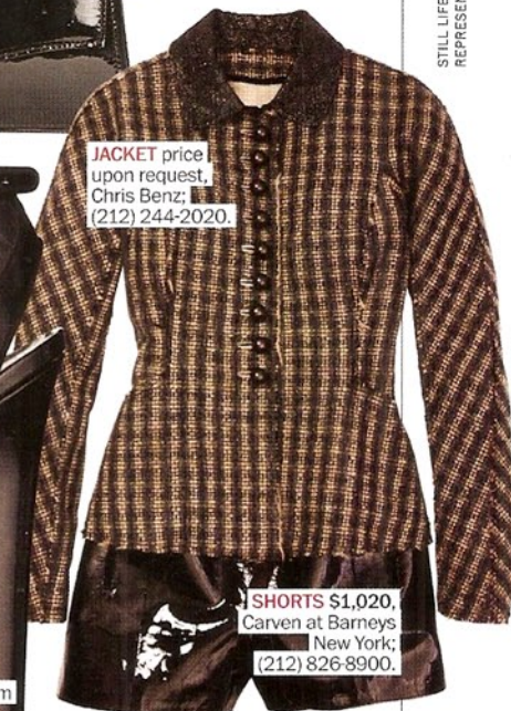
JACKET price upon request, Chris Benz; (212) 244-2020.