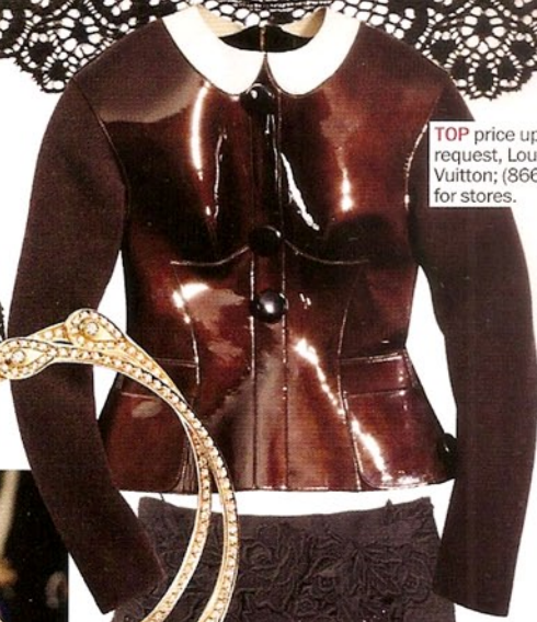
TOP price upon request, Louis Vuitton; (866) VUITTON for stores.