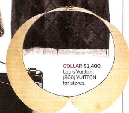
COLLAR $1,400, Louis Vuitton; (866) VUITTON for stores.